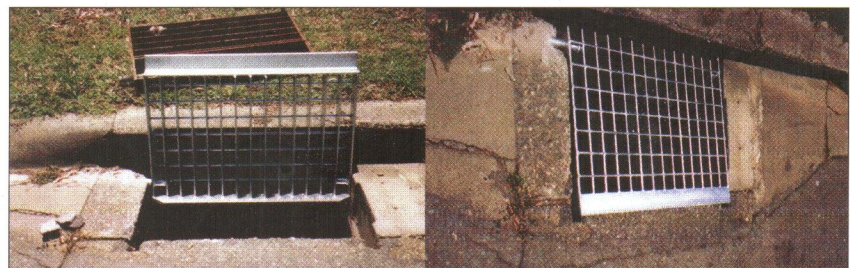
PATENT PRODUCTS Fig 69 Replacement Gully Grate to AS 3996

600 X 600 CLEAR OPENING 900 X 600 CLEAR OPENING Hinged & bolted to frame