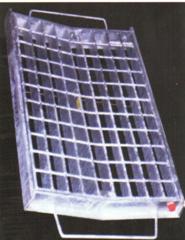
Vee TYPE GULLY GRATE & FRAME CLASS D

600 X 600 CLEAR OPENING 900 X 600 CLEAR OPENING Hinged & bolted to frame